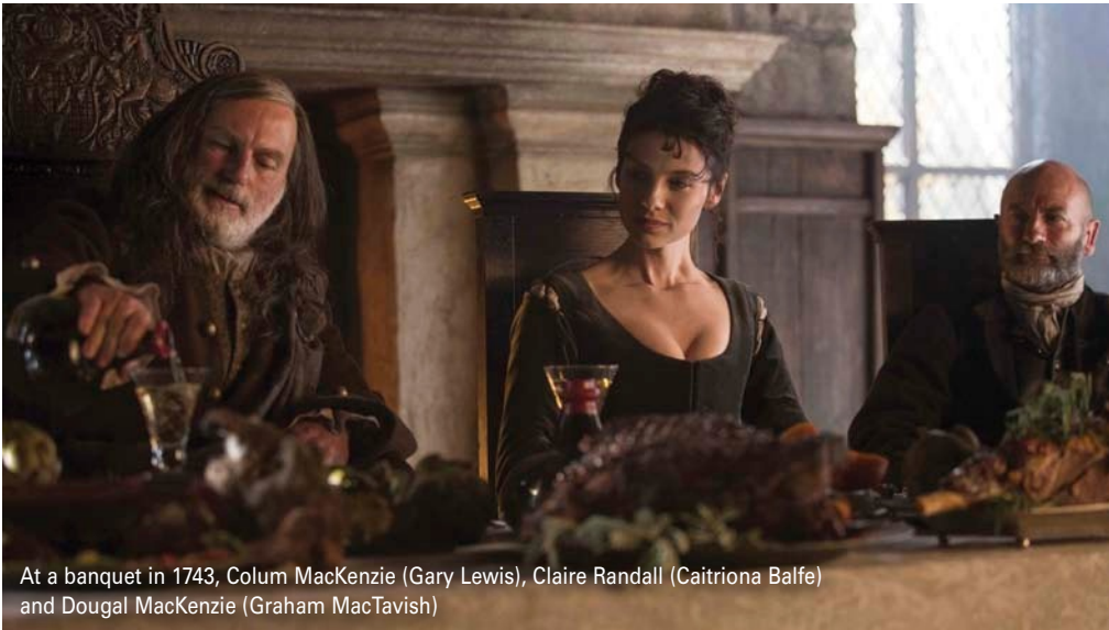
At a banquet in 1743, Colum MacKenzie (Gary Lewis), Claire Randall (Caitriona Balfe) and Dougal MacKenzie (Graham MacTavish)