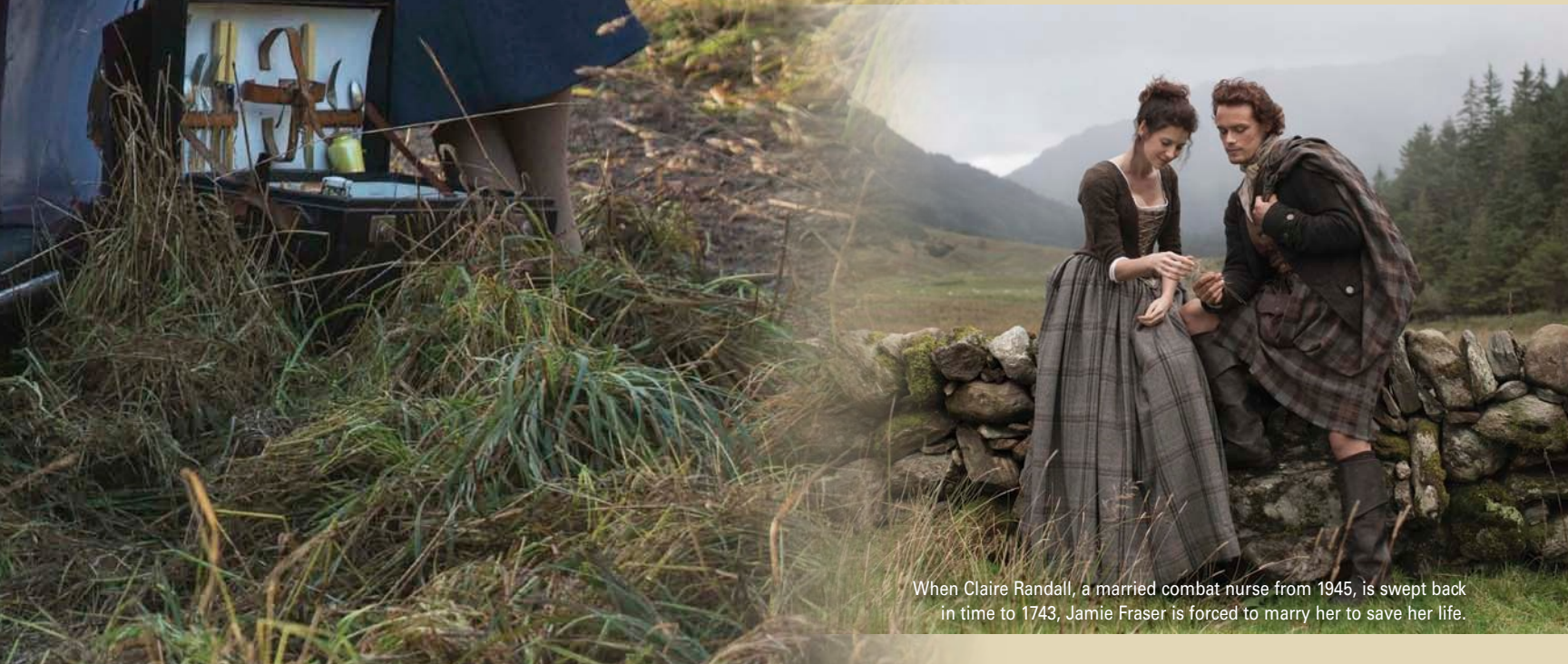
When Claire Randall, a married combat nurse from 1945, is swept back in time to 1743, Jamie Fraser is forced to marry her to save her life.

The production team developed separate looks—daytime, nighttime, interior and exterior—