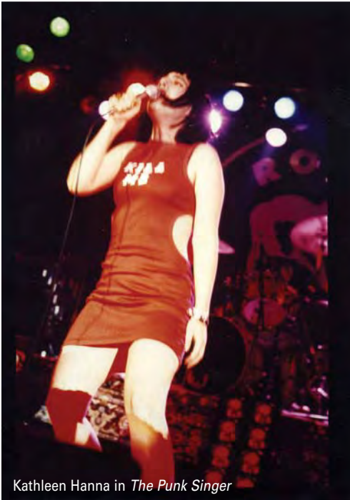
Kathleen Hanna in The Punk Singer